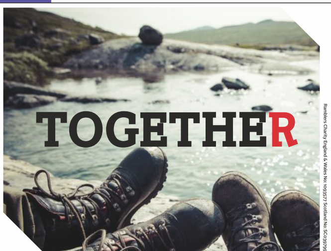
Ramblers Charity England & Wales No: 109357 Scotland No: SC039399

A moment to pause. Breathing in clear air. Sharing interests and conversations as you ponder the hills ahead. We have your passion for exploring worldwide and in the UK.