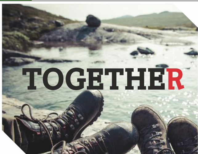
Ramblers Charity England & Wales No: 10357/Scotland No: SC039396

Starting from Henley we walk along the Fairmile to Fawley, down to Toad Hall garden centre for a delicious tea/coffee break, and back - or by bus if you fancy! 3.5 miles Free